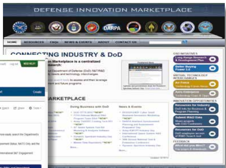
Above; Screen shot of the online Defense Innovation Marketplace. Left: Communities of Interest page at Techspace.